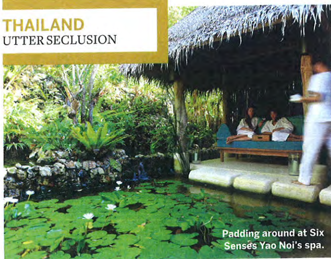
Padding around at Six Senses Yao Noi’s spa.