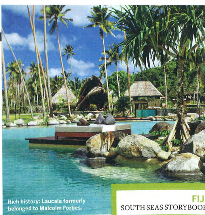
Rich history: Laucala formerly belonged to Malcolm Forbes.

At Japan’s Hoshinoya Karuizawa spa and resort, in a rural village alongside a river of healing hot springs, cultural immersion takes on a literal, delectable definition. Since 1914, the site has attracted Japan’s poets, priests, and emperors. The area was spared damage during the recent earthquake, and today you can continue the tradition of solace seekers in the valley, about 90 miles northwest of Tokyo. Sink into your villa’s private tub of steaming spring water, or alternate between the spa’s warm and cool meditation pools. Raised riverside walkways connecting private villas to Hoshinoya’s teahouse and library also lead into town, where galleries feature local crafts and creameries scoop Japanese-style gelato. Doubles from $550, including breakfast daily and one tea service or guided nature tour.